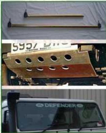
Heavy Duty Steering Rods

An example of some of the Defender Parts & Accessories we have available